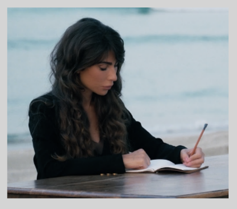
CLICK THUMBNAILS BELOW TO WATCH